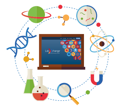
Create. Experiment. Solve. Share.

"LabXchange is a powerful tool for maintaining a link with the laboratory during remote learning. I was able to develop educational resources, including simulations, which students found interesting and engaging." – GILLES ROSSI, ABE teacher, France